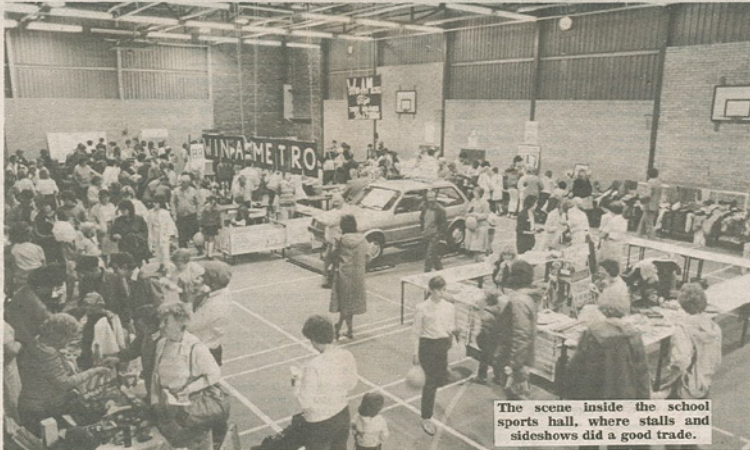
The scene inside the school sports hall, where stalls and sideshows did a good trade.