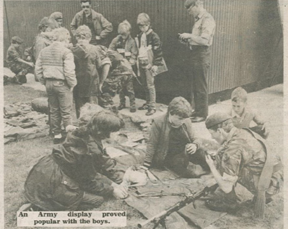
An Army display proved popular with the boys.