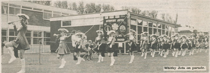
Whitby Jets on parade.