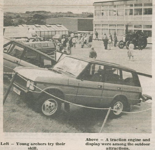
Above - A traction engine and display were among the outdoor attractions.