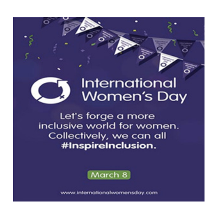
What kind of world do you want to live in?